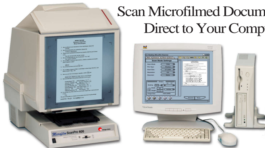
ScanPro 400 shown with Fiche Carrier (monitor and PC not included)