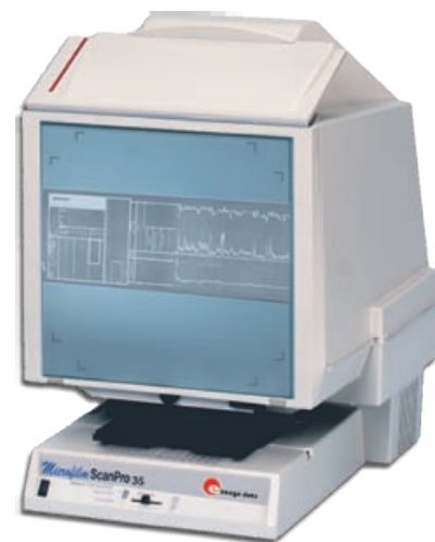
ScanPro 35 shown with fiche carrier and Well Log Microfilm Image

- MyCensuses Genealogy - G Beavington, British Columbia, Canada