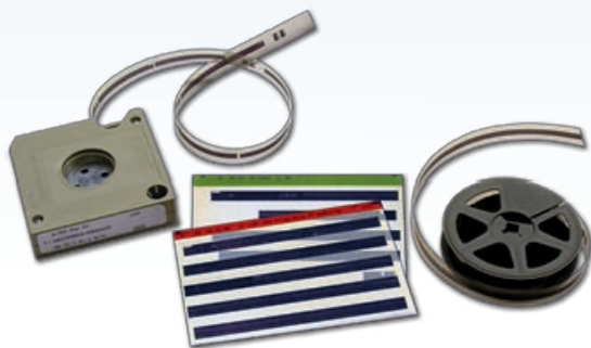
Well Logs on Cartridge Film, Fiche, and 16mm Open Spool

The ScanPro 35 is a low cost microfilm scanner for well logs and strip charts stored on fiche, 16mm roll film, and cartridge film. You simply follow the step-by-step instructions right on your computer monitor to scan as many segments of the microfilm image as you want and the included Auto ImageAssembler software automatically assembles them into a final seamless image on your computer.