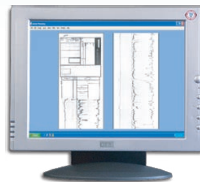
LCD Monitor Shown with side-by-side Well Log Scans

Connect the ScanPro 35 to your computer and e-mail, fax, network, print, and store to other media like CD-ROM, right from your PC.