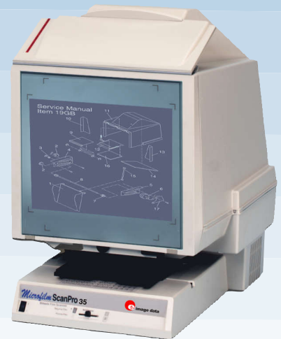
ScanPro 35 with Aperture Card Carrier Showing "A" sized drawing on View Screen