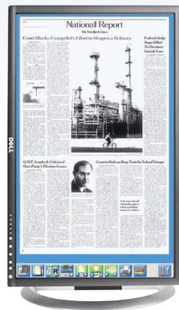
24" LCD Monitor (optional) Shown with Newspaper Image