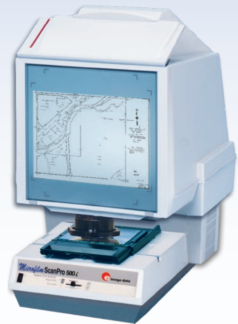
ScanPro 500 Shown with Aperture Card/Fiche Carrier

- Adams County Library - E Stephen, Thornton, CO