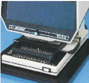
Add a heavy duty turntable for greater versatility in viewing. Part No. 7078